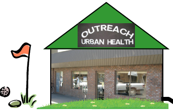
*Clinic may not appear exactly as shown