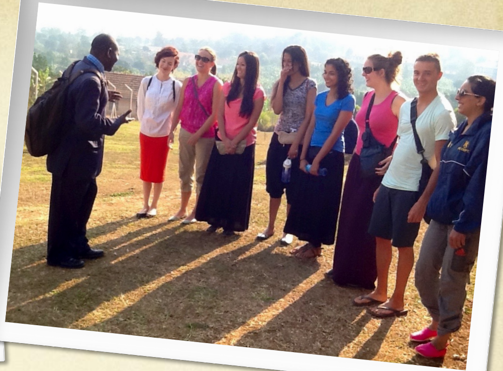
At Masaka Regional Hospital